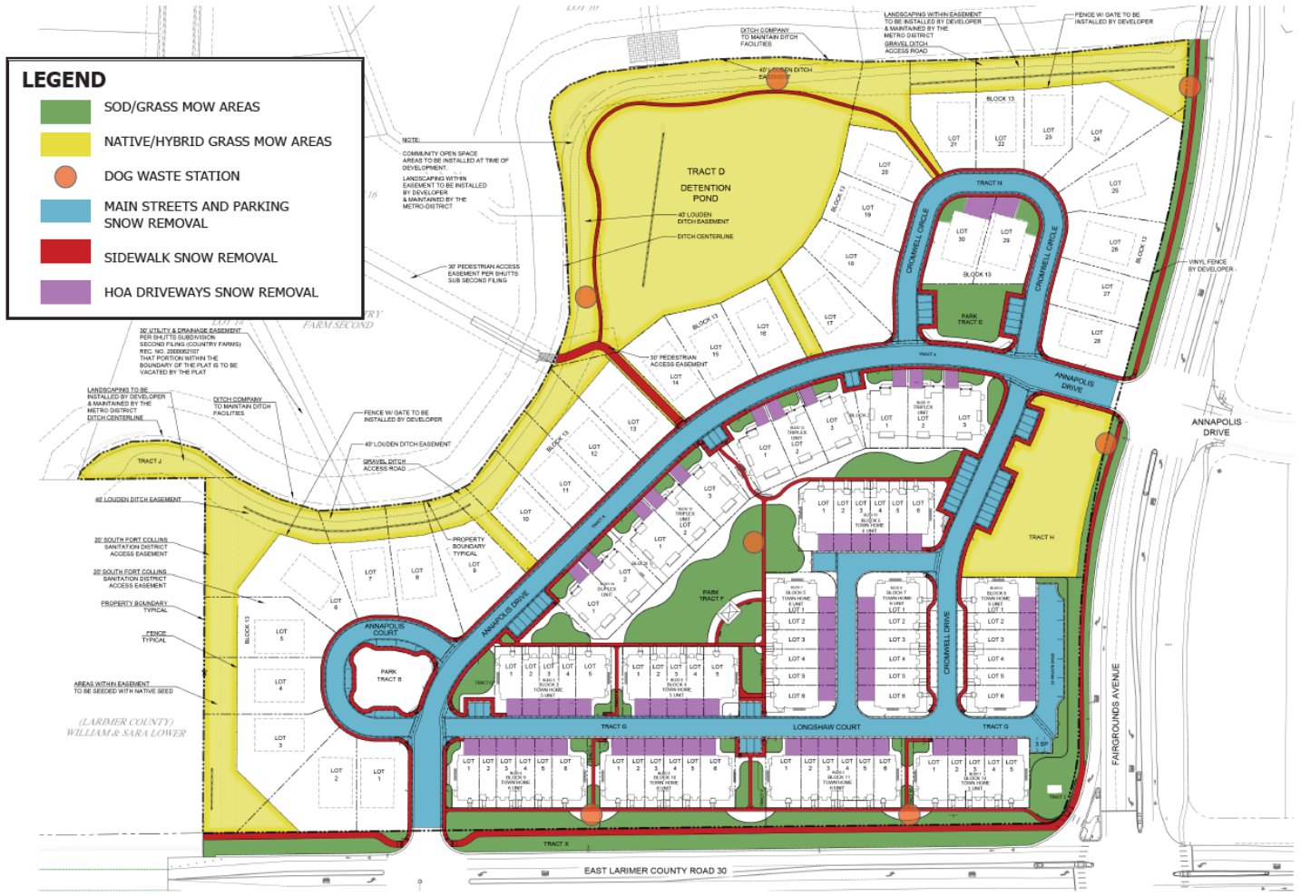
COUNTRY FARMS - MAINTENANCE EXHIBIT